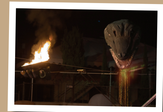
In the January performance of “The Fish Boy’s Dream” a giant dino head is set aflame.