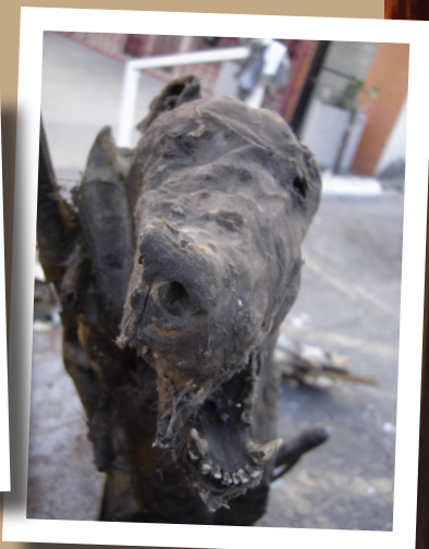
A canine carcass gives a creepy aesthetic to one of the SRL props.