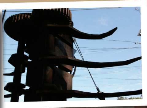
Detail of the inch-worm bot.